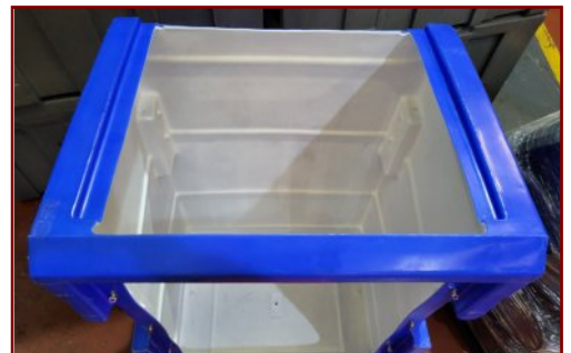
Open Topped Trolley