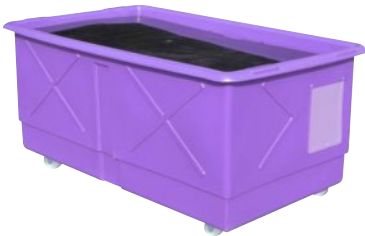
(F) Spring Loaded Trolley 569-A