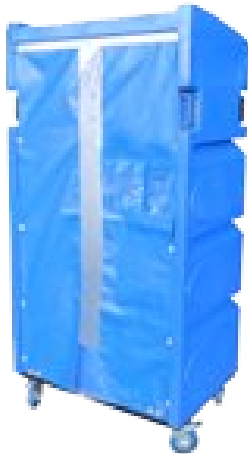
(B) - Curtain Top & Front 611-A