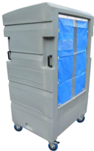
(E) - Tallboy Parallel Front 528-A