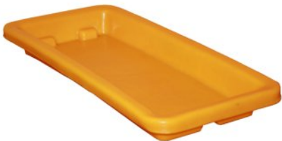
(L) SP Tray 682-A