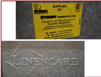
Mould in Graphic / Embossment Plate