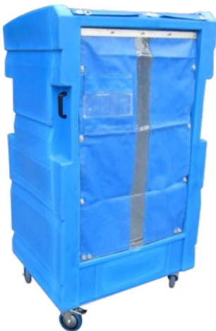
(B) - Curtain Top & Front With Parallel Front 593-A