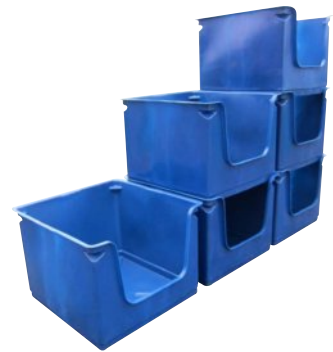
(K) Stack-N-Store (Large) 550-A