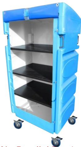
(A) - Parallel Front 412-A