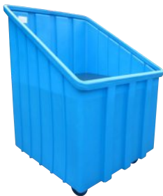
(H) Cube High Back Trolley 594-A