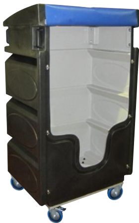
(D) - Low Profile Parallel Front 498-A