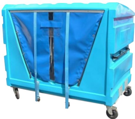
(A) - Standard Trucking Trolley: 372-A