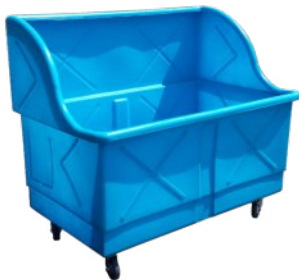
(G) High Back Trolley 609-A