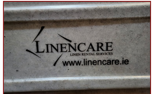
Screen Print on Body or Curtain