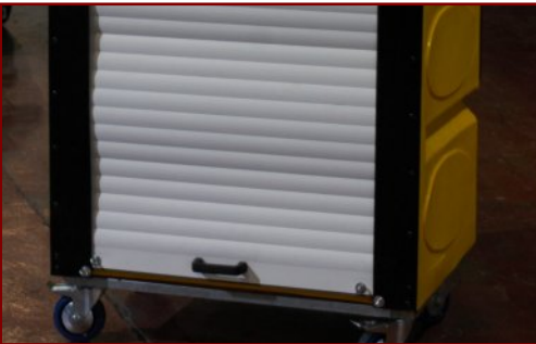
Roller Shutter Door