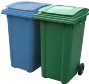
(N) 240L Wheelie Bin 117-A