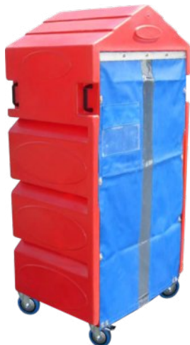
(F) - Apex Top 572-A