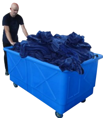
(E) Standard Loading Trolley 532-A