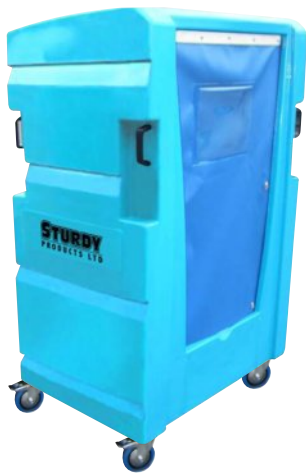
(C) - Tapered Front 571-A