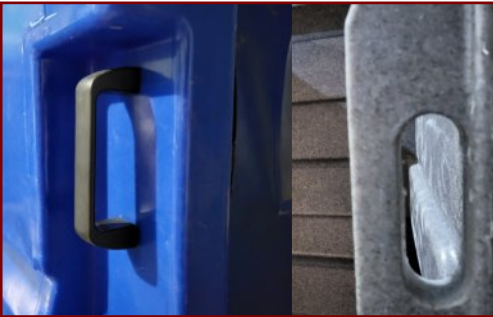
Handles: Push Pull / Cut Out