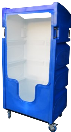
(C) - Open Top & Front 612-A