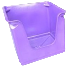
(J) Stack-N-Store (Small) 549-A