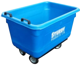
(A) Tote Buggy 250L 598-A