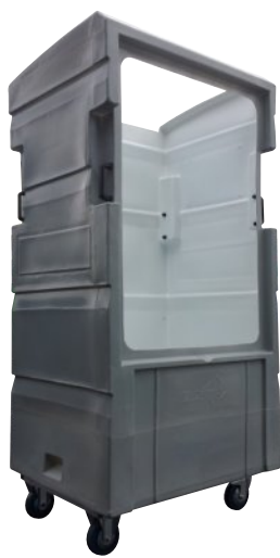
(F) - Tallboy Open Top & Front 591-A