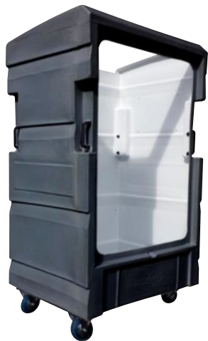
(D) - Open Top & Front With Parallel Front 610-A