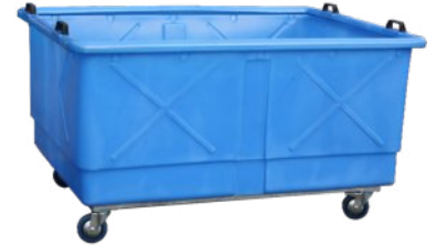
(D) Extra Wide Loading Trolley 681-A