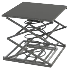
(I) Self Levelling Floor 595-A