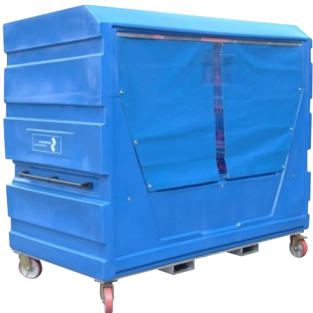
(B) - Super Trucking Trolley: 481-A