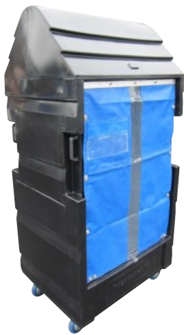
(G) - Apex Top 592-A