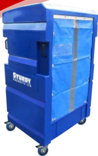
(A) - Parallel Front 350-A