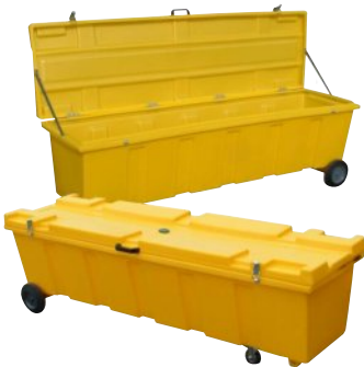
(M) High Security Laundry Box 579-A