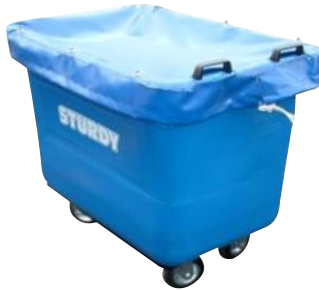
(B) Tote Buggy 330L 599-A