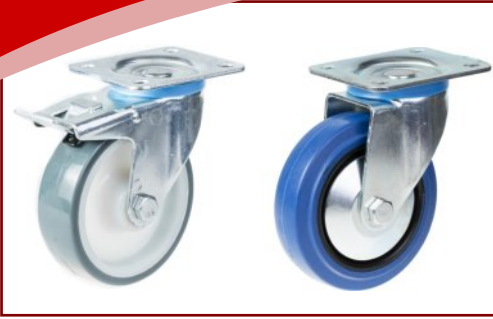
Castors: Grey Nylon / Blue Rubber