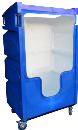
(E) - Low Profile Open Top & Front 613-A