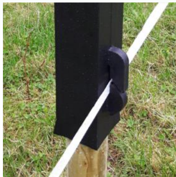
Suitable for Electrical Tape