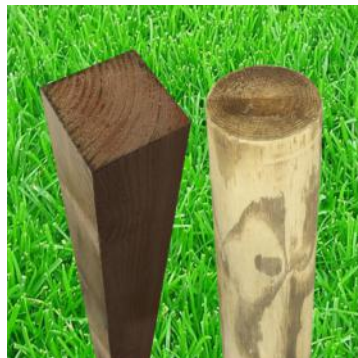
Suitable for 3" Square or Round Posts