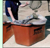
330lt Craneable Mortar Tub

Length: 1,000mm Width: 700mm Height: 700mm Code: 036 - A